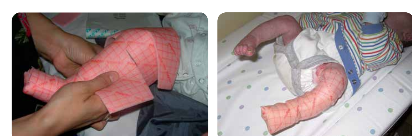
Example of a template for the foot and leg. We usually cut slits in the dressing over the joints to allow for movement and wrap firmly around the foot and leg.