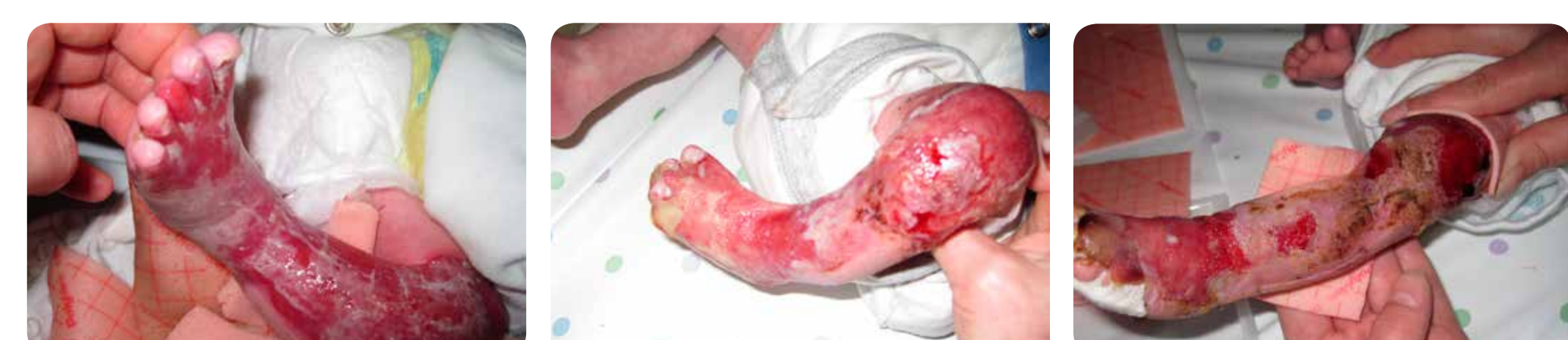
After 3 days use of PolyMem

G had generalised severe junctional EB. He was born with a deep, extensive wound covering his left leg. Experience has shown that prenatal wounds in this type of EB do not heal and are generally present until the infant dies. In general we find that many of the atraumatic dressings used today prevent extension of the wound but have no impact on healing. PolyMem dressings were applied at the first dressing change and changed daily due to the large volume of exudate. The wound remained clean and healed rapidly. We have never had this positive experience in a baby with this form of EB before.